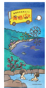
the One day Free Pass