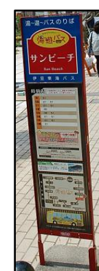
Busstop of "Yu-Yu" Bus

Please note that the busstop of "Yu-Yu Bus" is different from the one of the local bus.