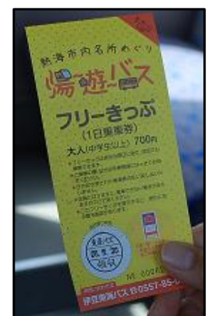
the One day Free Pass