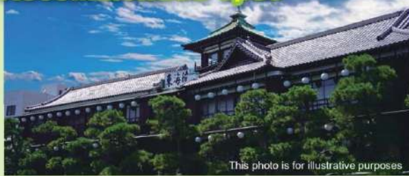
This photo is for illustrative purposes

Tokaikan (Ito City Tangible Cultural Heritage) Constructed in 1928, this was a three-story Japanese inn (currently open as a tourist facility). In this Japanese-style building, you can feel that atmosphere of the day. Enjoy viewing the beautiful architecture, including the 120-tatami mat grand hall, and the detailed wooden mosaic paper screens and display windows constructed with traditional Japanese techniques by the craftsmen of the time.